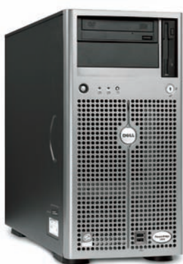
Dell PowerEdge 1800

The PowerEdge 1800 server delivers entry-level pricing with the latest in processor technology, expandable performance, availability and manageability, all in a flexible, cost-effective system.