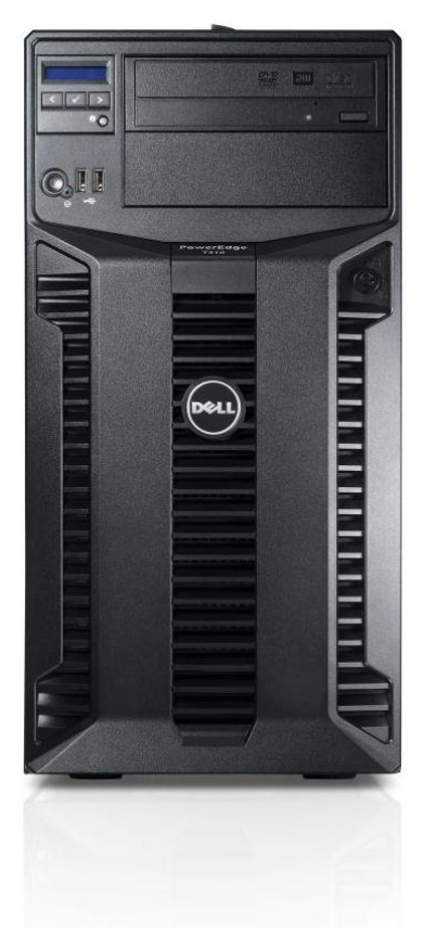
Figure 2. Front View (With Bezel)

Figure 2 shows the front view of the PowerEdge T310.