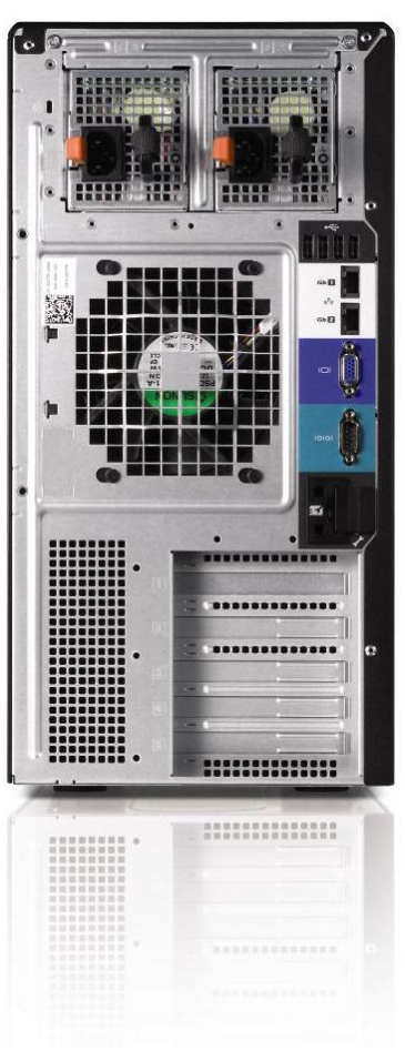
Figure 3. Back View

Figure 3 shows the back view of the PowerEdge T310.