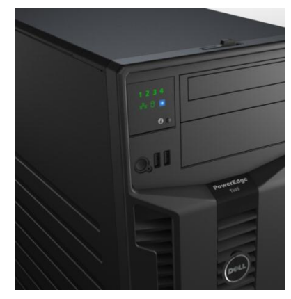
Figure 5. LED Control Panel

For a complete description of LED indicators, their causes, and possible courses of action to take to resolve an error, see the Diagnostic Lights (Optional) section in the About Your System chapter in the PowerEdge T310 Hardware Owner's Manual on <u>Support.Dell.com/Manuals</u>.