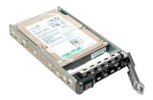
Figure 3. 2.5" HDD Carrier

The M610 supports a 2.5" hard drive carrier as shown in Figure 3.