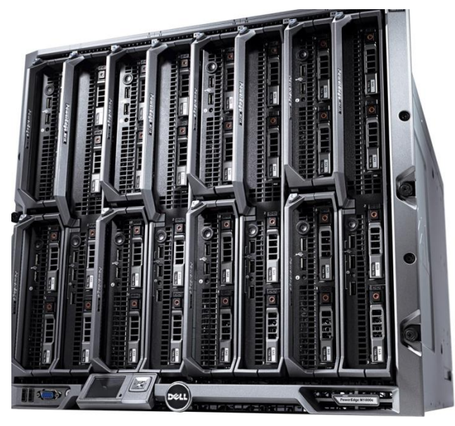
Figure 1. PowerEdge M1000e

The Dell<sup>™</sup> PowerEdge<sup>™</sup> M610 is a half-height blade server that requires an M1000e chassis to operate.