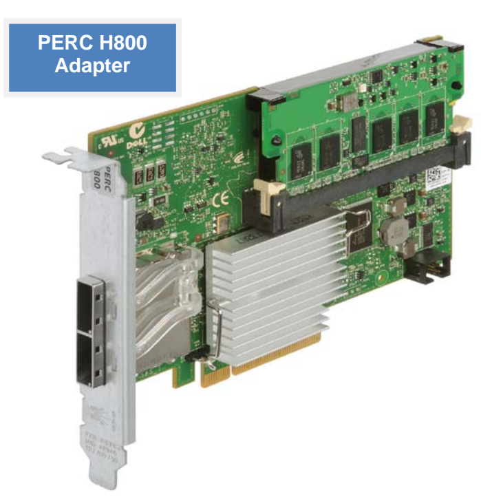
Figure 1. PERC H700 and H800 Views